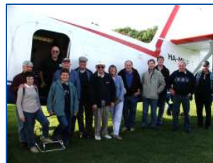
The Chosen Few. Lucky (?)Winners Of