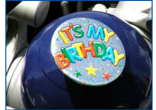
Airframe Mod (Propeller) #b20/2005