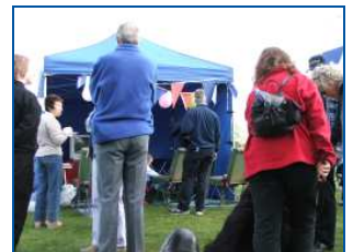
An-2? Who Cares?! The Foods Here!

Many thanks to all who came. More Photos soon!