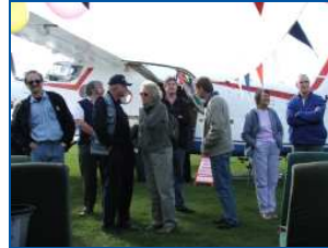
Is This The Coach Back To The Asylum?